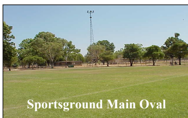
Sportsground Main Oval

The Katherine Showground is home to Aussie Rules in Katherine.